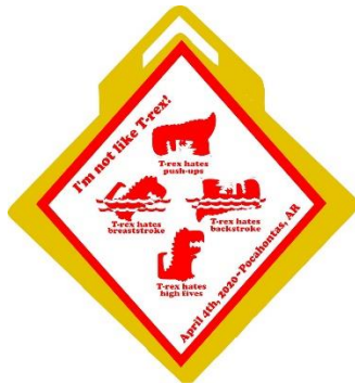
High Point Medals