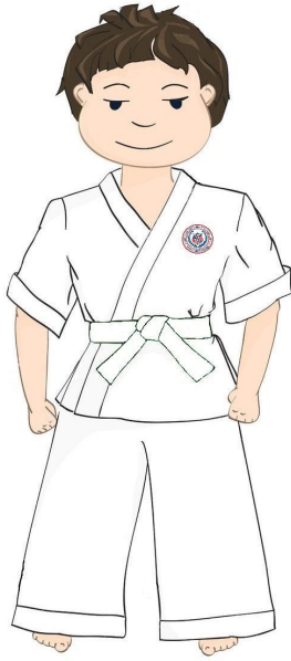
Beginners must wear White Belts