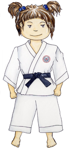
Advanced must wear Black Belts