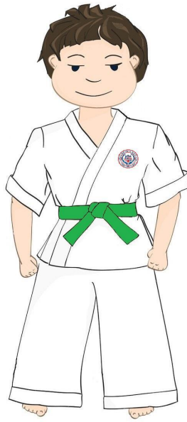
Novice must wear Green Belts