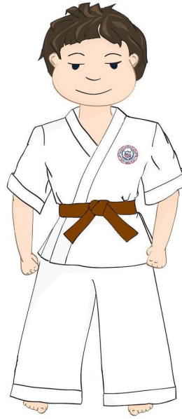
Intermediate must wear Brown Belts