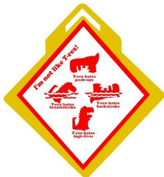
High Point Medals