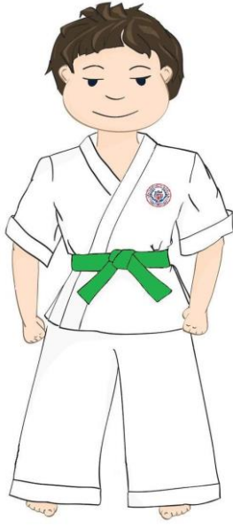
Novice Green Belts