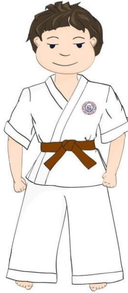
Intermediate Brown Belts