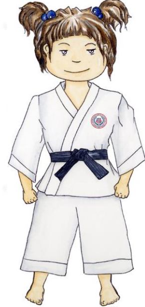
Advanced Black Belts

– All ages and levels MUST Wear AAU Patch –