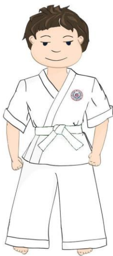
Beginners White Belts