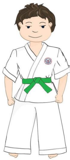
Novice Green Belts