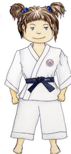
Advanced Black Belts